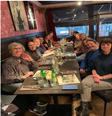
Kick off meeting to Roeselare -Belgium

The Positive Health is dynamic concept of health (euPREVENT Congres 2017). In this new definition Health is seen as the ability to adapt and to self manage, in the face of social, physical and emotional challenges.