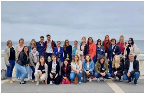
1 st TPM in Spain -Santander from 9 th to 13 th of May 2022 hosted by IES Manuel G. Aragón