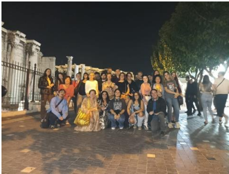
2 nd TPM in Greece -Athens from 10 th to 13 th of October 2022 hosted by MODERN BIOMEDICAL PROFESSIONS (SBIE) .

THE HEALTH4EU PROJECT'S PARTNERSHIP IS COMPOSED BY A GROUP OF 7 ORGANIZATIONS, COMING FROM 7 DIFFERENT EUROPEAN COUNTRIES (BELGIUM, CZECH REPUBLIC, FINLAND, GREECE, LATVIA, THE NETHERLANDS AND SPAIN). THE PARTNERS WERE CHOSEN BECAUSE OF THEIR DEMONSTRATED EXPERIENCE AND THEIR COMPLEMENTARY EXPERTISE AND NETWORKS, WHICH WILL ENSURE HIGH QUALITY RESULTS IN ALL THE DIFFERENT PHASES OF THE PROJECT.